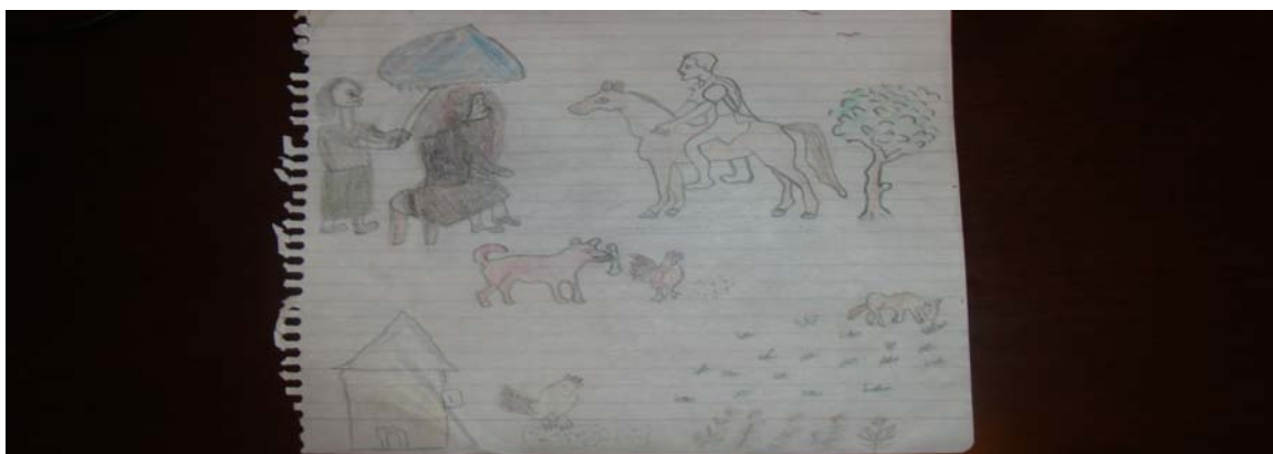
Early Marriage - A picture drawn by a 13 year boy

Girls, especially older girls above the age of 13, were identified as the recurrent victims of sexual harassment, rape and sexual exploitation (including abduction and early marriage among the rural group). Girls who are victims of trafficking were also identified as the most vulnerable to sexual exploitation. Though not common, respondents contacted in Woldiya also reported high levels of vulnerability for younger girls. In both sites, children identified boys as victims of rape. A 13 years old boy in Woldiya stated that “one of the most difficult and horrifying moments of my life was when I saw my friend (a boy) being raped by a man.” In all cases, older boys and adult men are included in the list of perpetrators by the respondents. The Addis Ababa group extended the list of perpetrators of rape to family members. Moreover, the role of persons engaged in trafficking of children including bus drivers and bar owners were noted by older children in both sites.