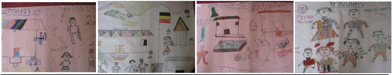
Community mapping and vulnerable children