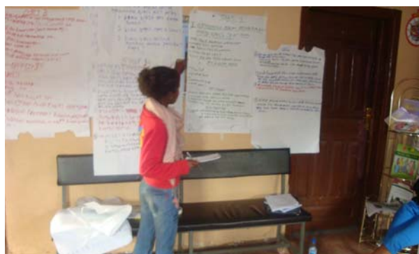
Presentation of a group discussion