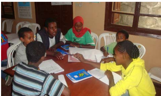
Children engaged in small group discussion